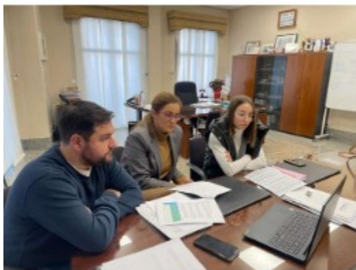
Reunión sobre el proyecto

El Ayuntamiento de Rafelbunyol es el líder de 'InclusEU', un proyecto europeo destinado a la juventud, de cooperación entre 8 ciudades europeas.