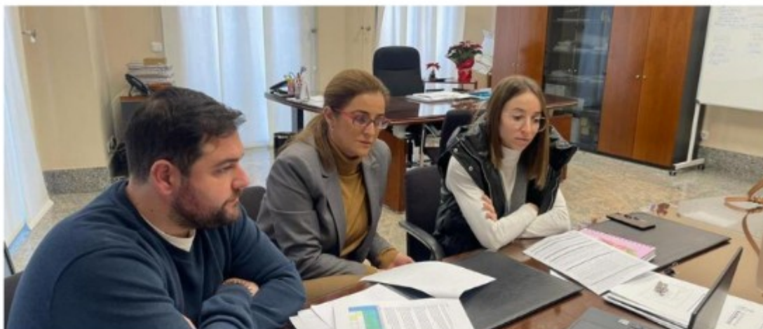
Primera reunión del proyecto europeo en Rafelbunyol / A.R.